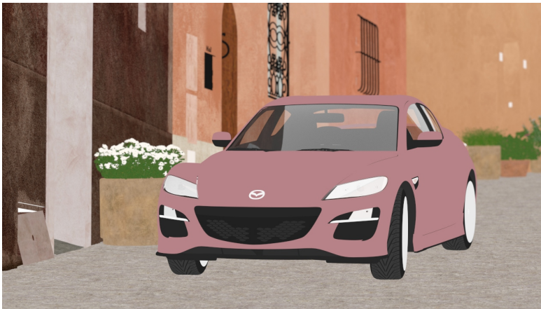
Figure 3.4 – Example albedo image obtained using the first diffuse or glossy (non-delta) hit. Note that the albedos of perfect specular (delta) transparent surfaces are computed as the Fresnel blend of the reflected and transmitted albedos.

incidence (e.g. from the artist friendly metallic Fresnel model) or the average reflectivity; or if these are constant (not textured) or unknown, the albedo can be simply 1 as well.