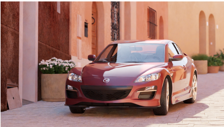
Figure 3.2 – Example output beauty image denoised using prefiltered auxiliary feature images (albedo and normal) too.

For denoising beauty images, it accepts either a low dynamic range (LDR) or high dynamic range (HDR) image ( color ) as the main input image. In addition to