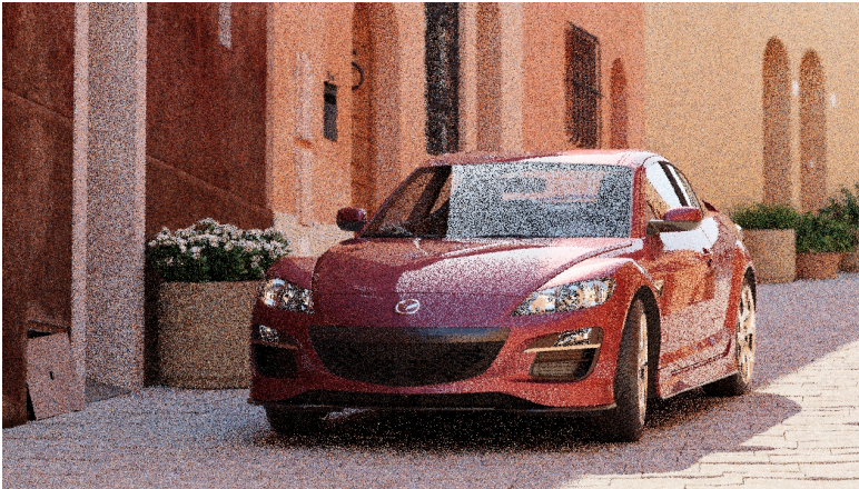
Figure 3.1 – Example noisy beauty image rendered using unidirectional path tracing (4 samples per pixel). Scene by Evermotion .

The RT (ray tracing) filter is a generic ray tracing denoising filter which is suitable for denoising images rendered with Monte Carlo ray tracing methods like unidirectional and bidirectional path tracing. It supports depth of field and motion blur as well, but it is not temporally stable. The filter is based on a convolutional neural network (CNN) and comes with a set of pre-trained models that work well with a wide range of ray tracing based renderers and noise levels.