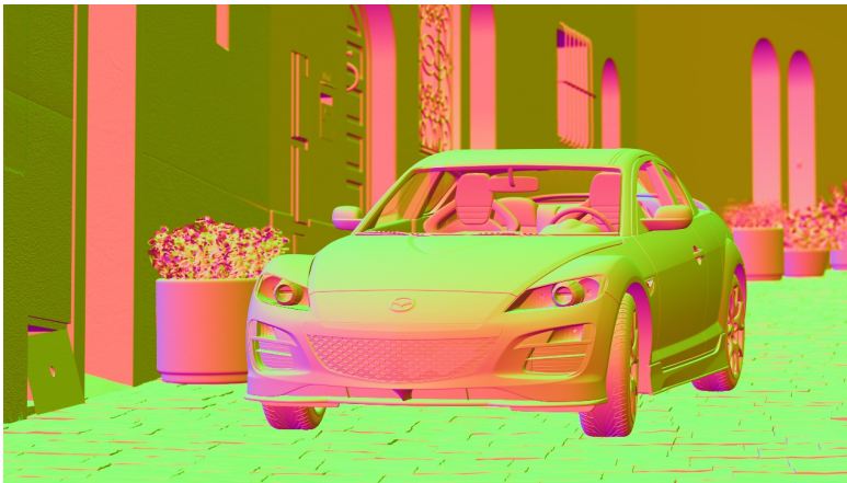
Figure 3.6 – Example normal image obtained using the first diffuse or glossy (non-delta) hit. Note that the normals of perfect specular (delta) transparent surfaces are computed as the Fresnel blend of the reflected and transmitted normals.