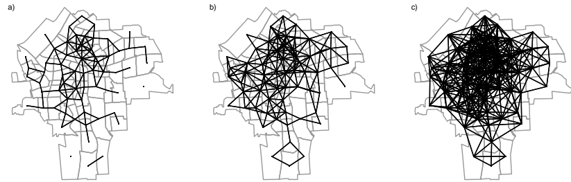
Figure 4: (a) Neighbours within 1,158 m; (b) neighbours within 1,545 m; (c) neighbours within 2,317 m

make.sym.nb function. The k = 1 object is also useful in finding the minimum distance at which all areas have a distance-based neighbour. Using the nbdists function, we can calculate a list of vectors of distances corresponding to the neighbour object, here for first nearest neighbours. The greatest value will be the minimum distance needed to make sure that all the areas are linked to at least one neighbour. The dnearneigh function is used to find neighbours with an interpoint distance, with arguments d1 and d2 setting the lower and upper distance bounds; it can also take a longlat argument to handle geographical coordinates.